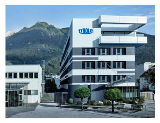
TYROLIT company headquarters in Schwaz, Austria

Day in, day out the experts at TYROLIT are busy working on solutions that accommodate the individual requirements of customers around the world; thus contributing to their business success. Some 80 000 available products set the standard in various industrial sectors.